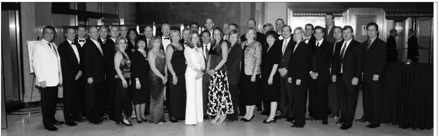
Members of the JANJ Board of Directors.