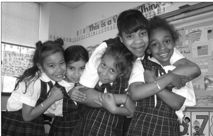
High School Heroes program at Leap Academy in Camden sponsored by Walmart.

“Thank you for the opportunity to be a role model to little kindergarteners.”