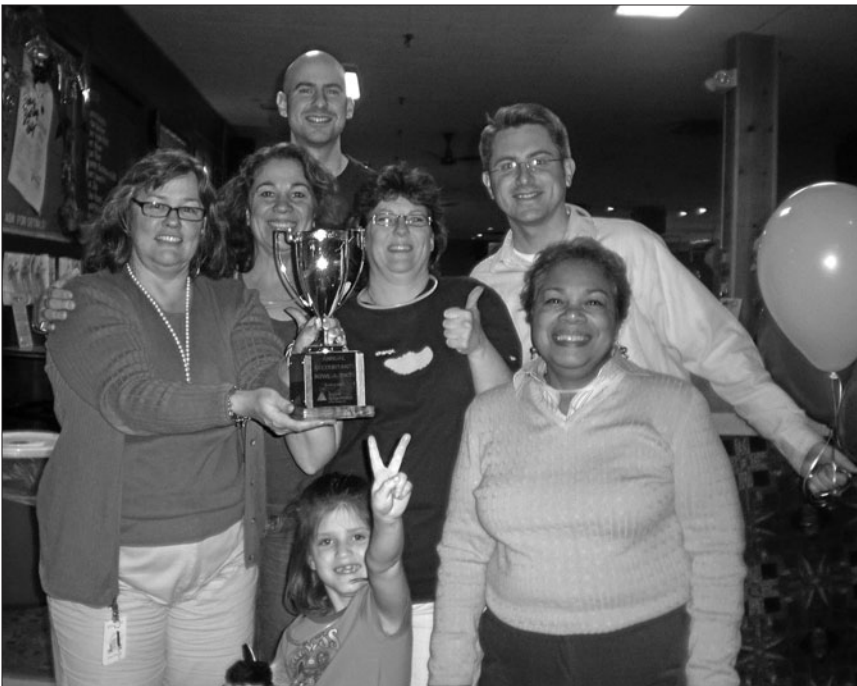
Above: Highest bowl-a-thon fundraisers from PricewaterhouseCoopers.

“It is especially rewarding and enjoyable to help provide hundreds of students with information they can use for the rest of their lives.”