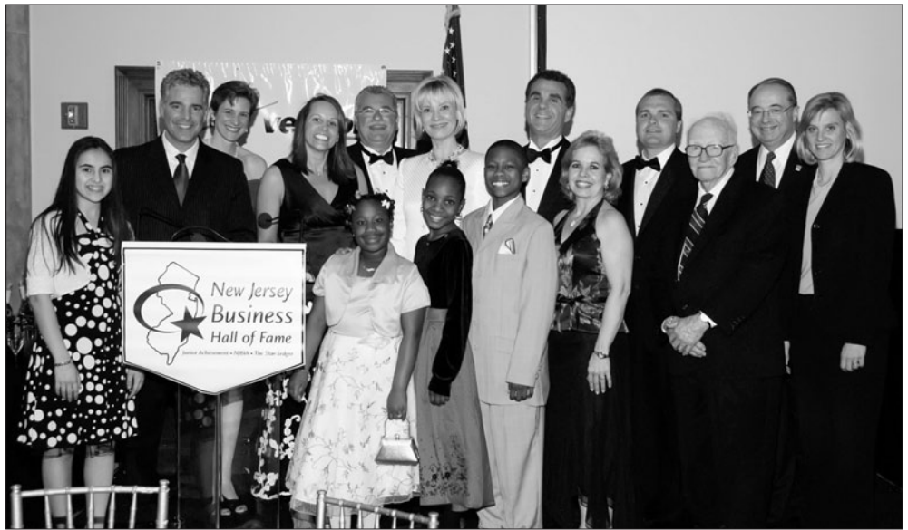
Above: Laureates joined by student presenters, members of the JANJ Board and distinguished guests.