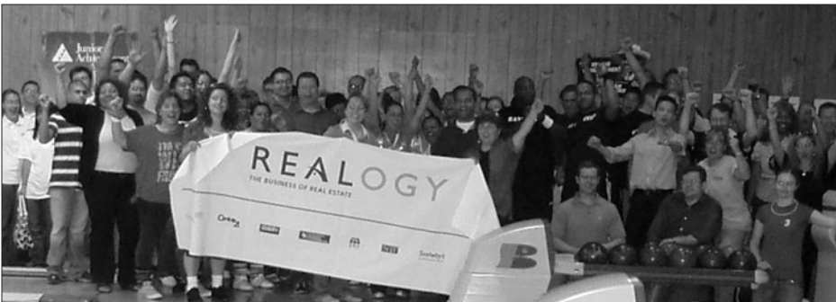
Above: Realogy bowl-a-thon volunteers