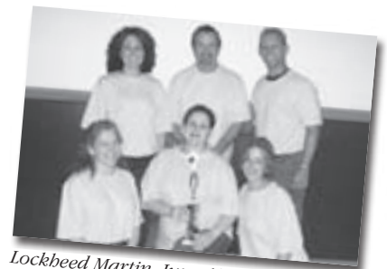
Lockheed Martin, June 10, 2010