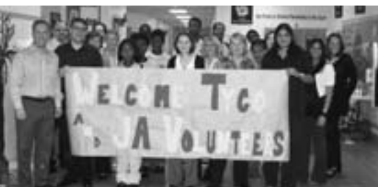
Tyco International, Ltd., JA Day at Parkway Elementary School, Ewing.