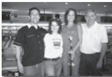
Realogy, June 10, 2010