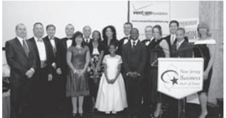
Distinguished Laureates join sponsors and event leaders at the 2010 New Jersey Business Hall of Fame™. JANJ wishes to acknowledge Title Sponsor Verizon along with event partners Continental Airlines, Marriott Hotels, NJBIA, and The Star-Ledger.