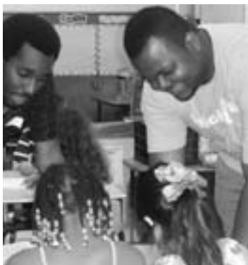
Deloitte volunteers and students from Pesbime Elementary School are working together on the JA curriculum. More than 570 students were reached on Deloitte Impact Day.