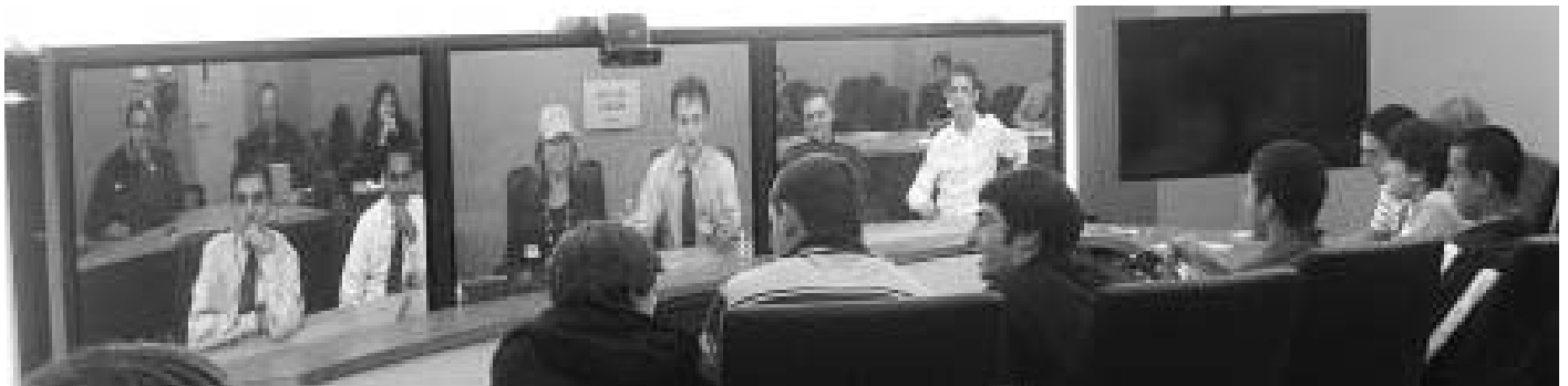
Through a partnership between AT&T and Cisco, students from across the state interacted via tele-presence to give them a JA Job Shadow called “The Ultimate Experience” on October 20, 2009.

“I’m very appreciative that you took the time to take us under your wing and give us some insight as to what a job is like. I definitely feel less apprehensive, and more confident, about the workplace environment after receiving your enthusiastic perspective. I liked hearing about your backgrounds, what it takes to succeed, and what is most important: to contribute and take joy in what you do. Thank you very much.”