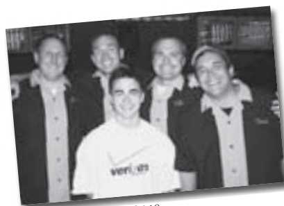
Verizon, May 21, 2010