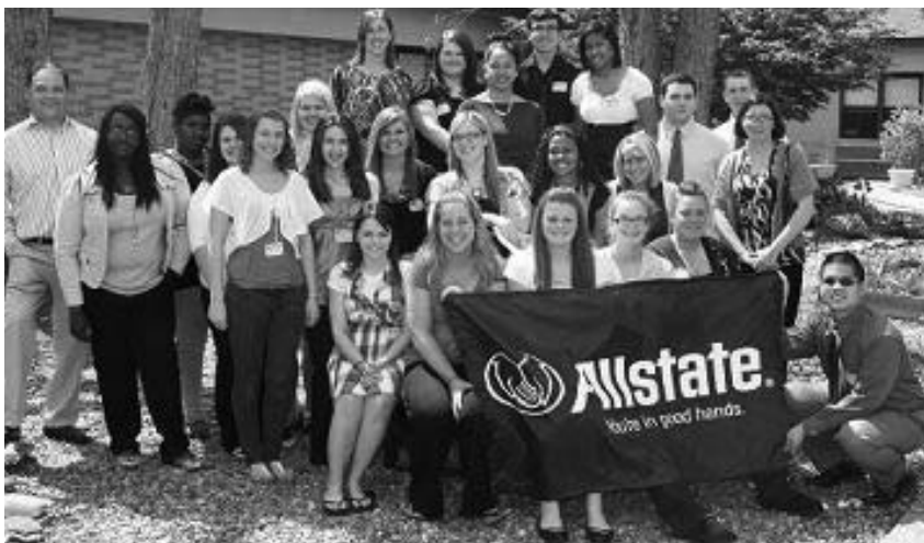
Through the Allstate NJ Foundation, Manchester High School Heroes volunteered at Ridgewood Elementary School on April 20th.

JA High School Heroes gives students service learning opportunities by volunteering with Junior Achievement in local elementary schools. Over the course of this school year 426 JA High School Heroes impacted 4027 elementary school students through this initiative.