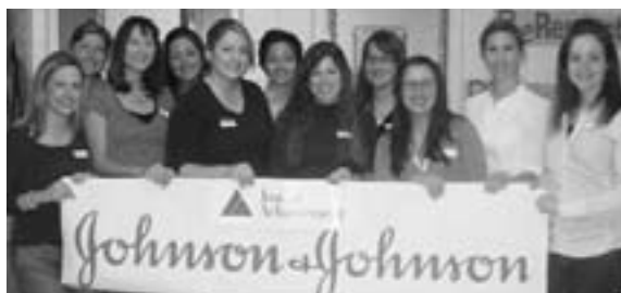
Volunteers from Johnson & Johnson joined GE Healthcare for JA's Pharma Day, reaching 333 students at Dewitt D. Barlow School in Plainfield.