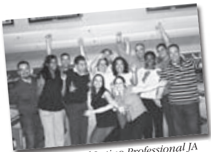
The 2nd Annual Latino Professional JA Day & Bowl, March 19, 2010