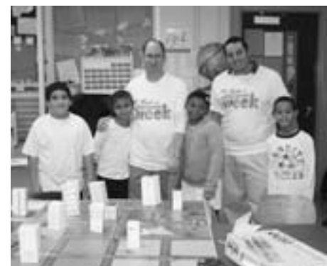
As part of Campbell's Make a Difference Week, 363 students at McGraw Elementary School in Camden received JA's curriculum.