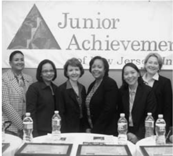
Panelists at the Women's Future Leadership Forum shared their personal stories with 50 female JA High School Heroes, who were later paired with women business leaders for one-on-one mentoring.

Junior Achievement of NJ wishes to acknowledge the following sponsors of The Women's Future Leadership Forum: Accenture, Cogen Technologies Linden Venture L.P., ConocoPhillips Bayway Refinery, DuPont, Emily C. Specchio Foundation, Infineum USA L.P., The Provident Bank.