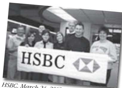
HSBC, March 24, 2010