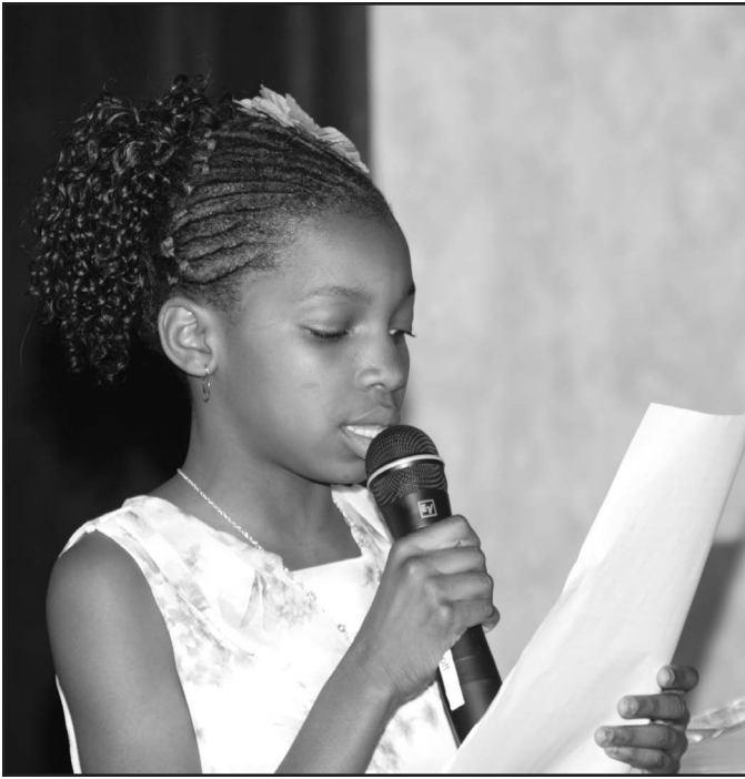
▲ Fifth grade student